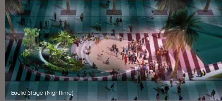
Euclid Stage (Nighttime)