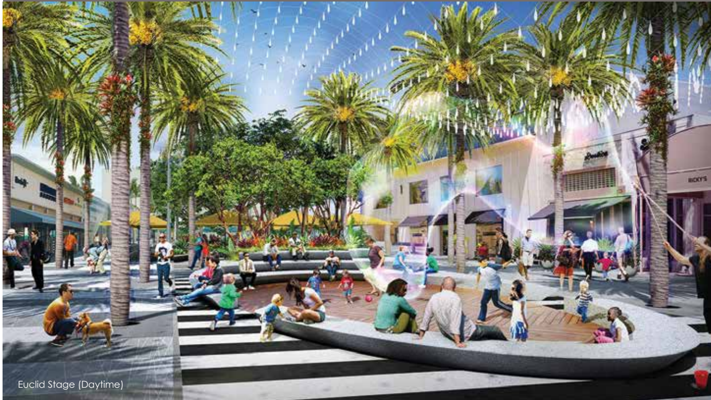
Euclid Stage (Daytime)