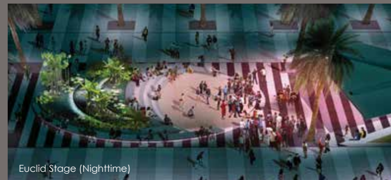
Euclid Stage (Nighttime)