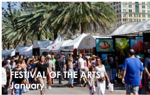
FESTIVAL OF THE ARTS January