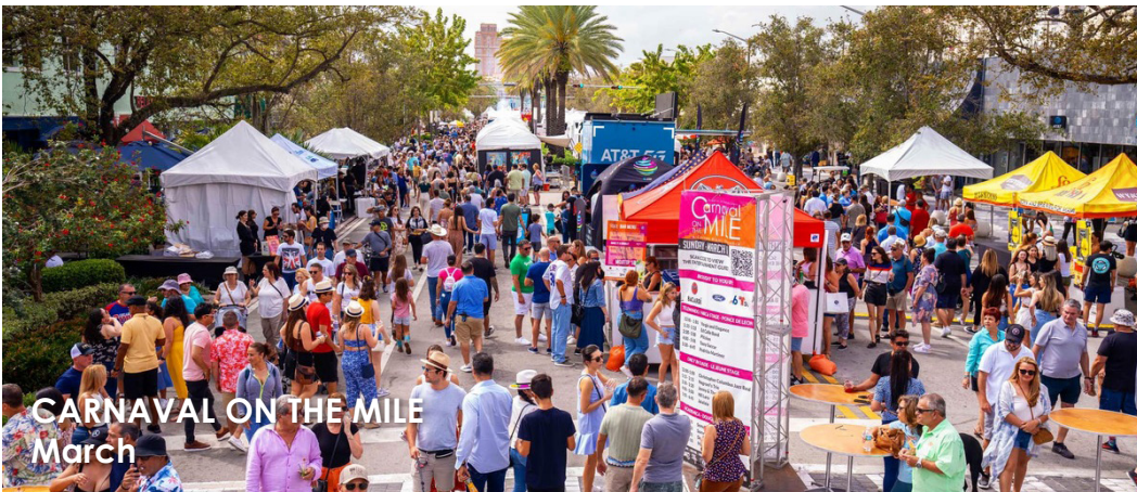
CARNAVAL ON THE MILE March