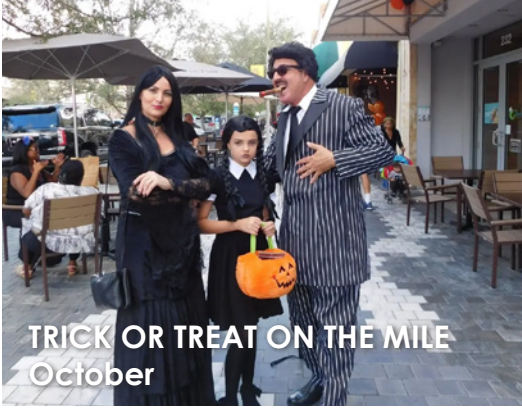
TRICK OR TREAT ON THE MILE October