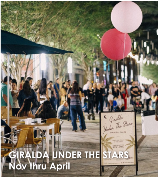
GIRALDA UNDER THE STARS Nov thru April