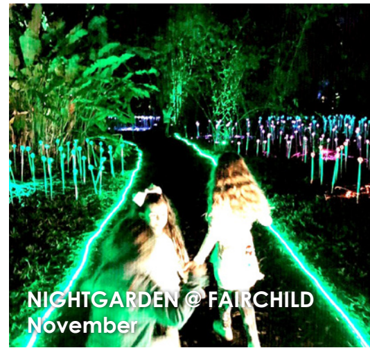
NIGHTGARDEN @ FAIRCHILD November