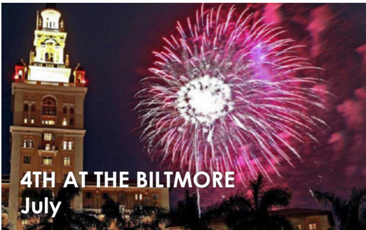
4TH AT THE BILTMORE July