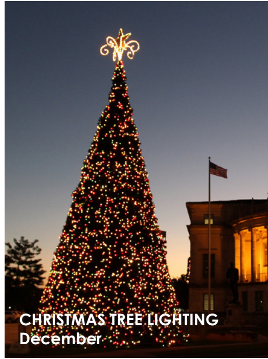
CHRISTMAS TREE LIGHTING December