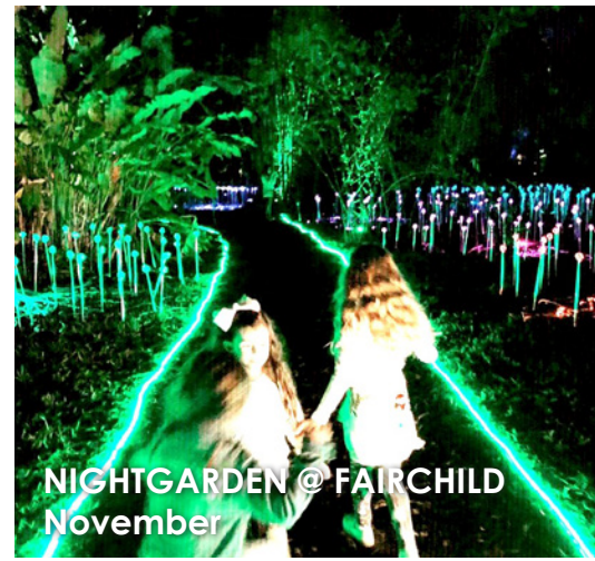
NIGHTGARDEN @ FAIRCHILD November