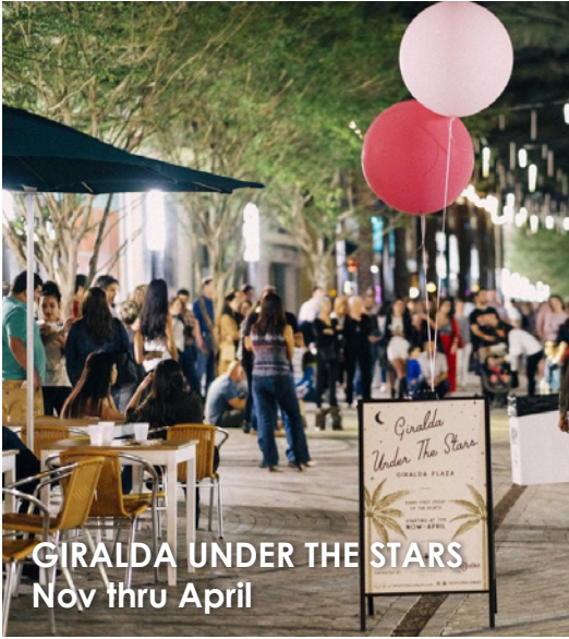
GIRALDA UNDER THE STARS Nov thru April