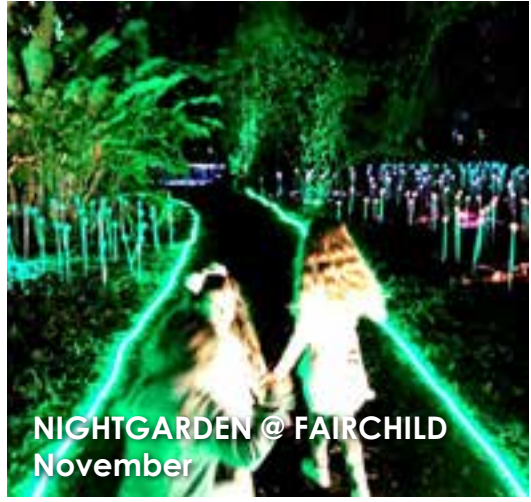
NIGHTGARDEN @ FAIRCHILD November