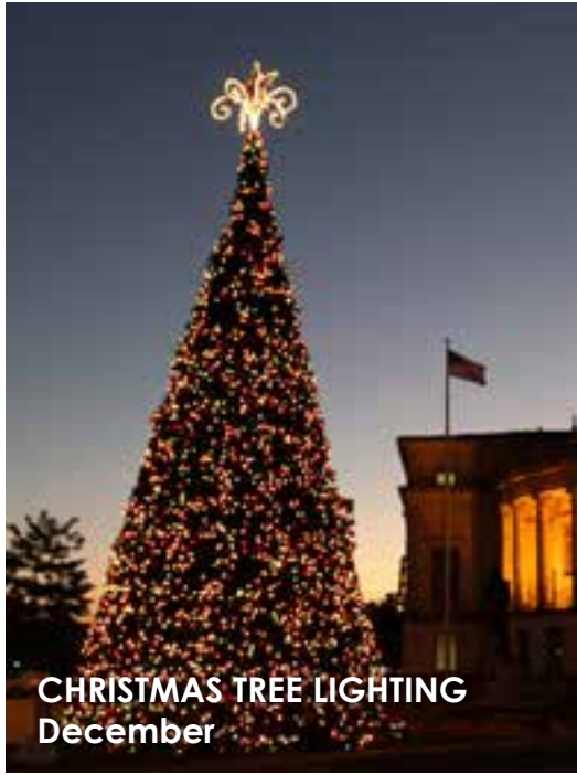
CHRISTMAS TREE LIGHTING December