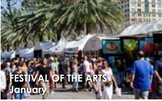
FESTIVAL OF THE ARTS January