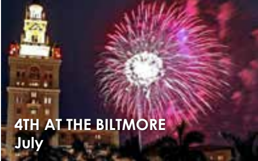
4TH AT THE BILTMORE July