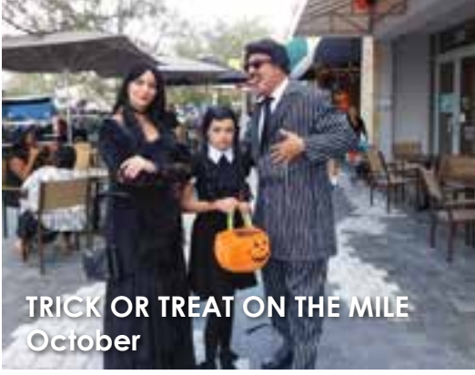
TRICK OR TREAT ON THE MILE October