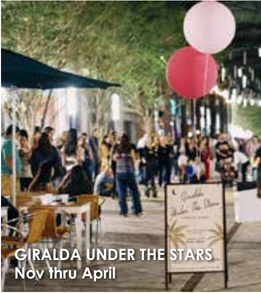
GIRALDA UNDER THE STARS Nov thru April