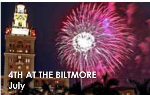
4TH AT THE BILTMORE July