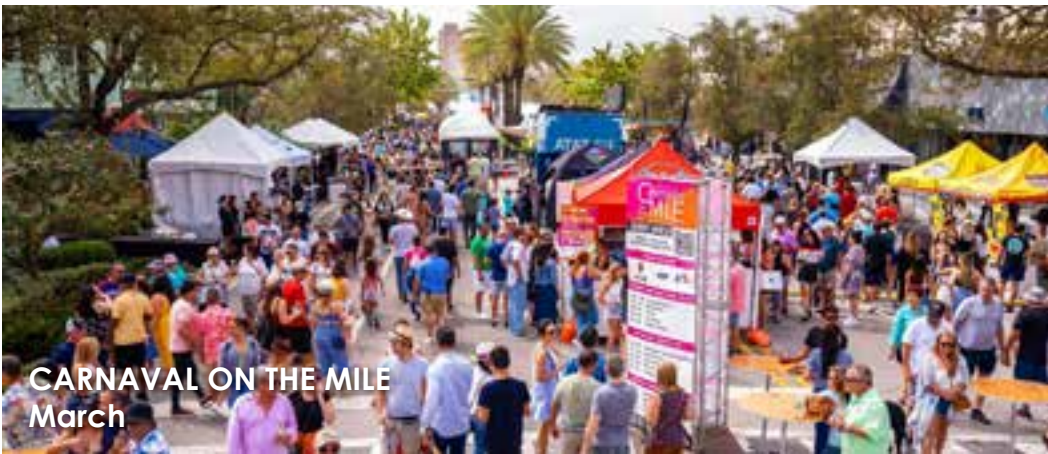
CARNAVAL ON THE MILE March