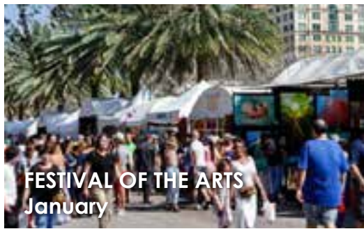
FESTIVAL OF THE ARTS January