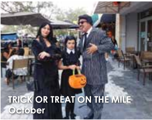
TRICK OR TREAT ON THE MILE October