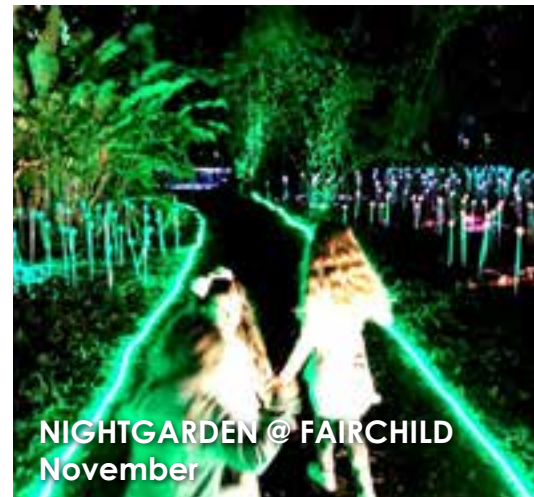
NIGHTGARDEN @ FAIRCHILD November

Book Signings & Readings at Books and Books Artistic and cultural activations