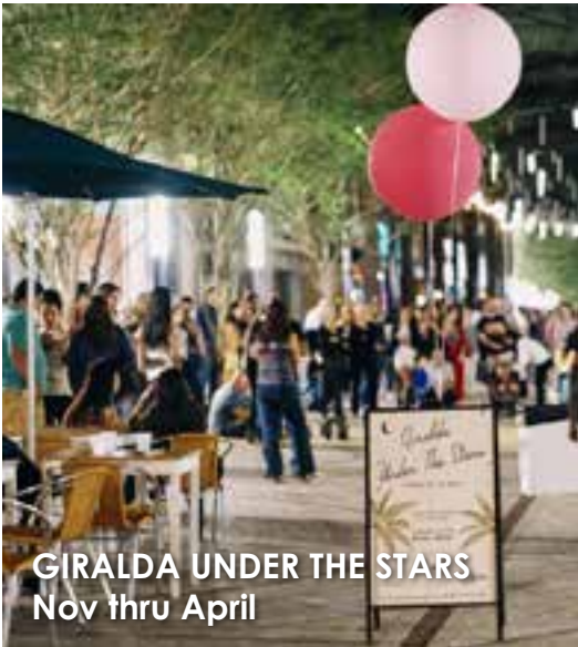
GIRALDA UNDER THE STARS Nov thru April