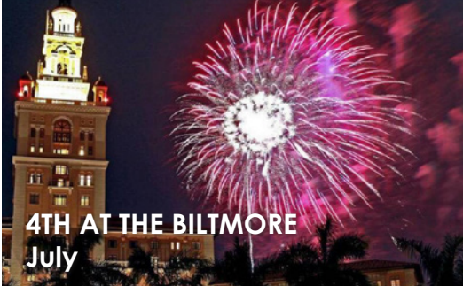
4TH AT THE BILTMORE July