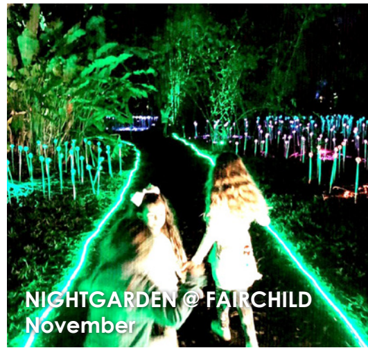
NIGHTGARDEN @ FAIRCHILD November