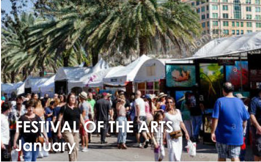
FESTIVAL OF THE ARTS January