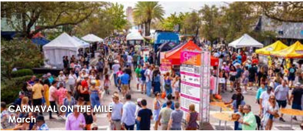
CARNAVAL ON THE MILE March