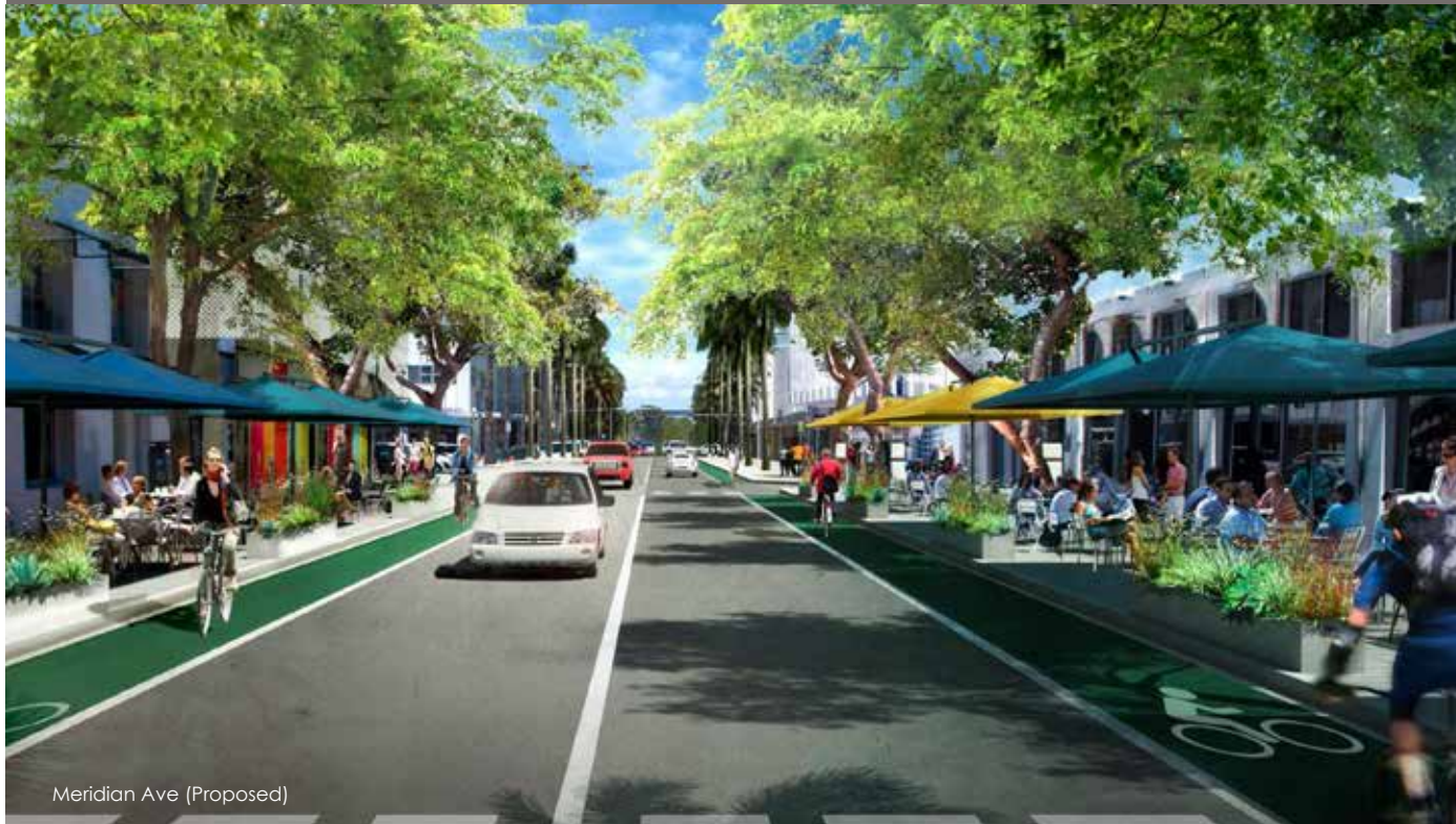
Meridian Ave (Proposed)